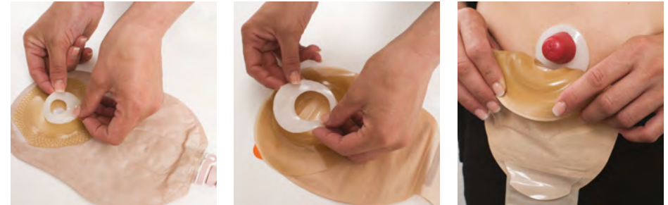
Application to the peristomal skin